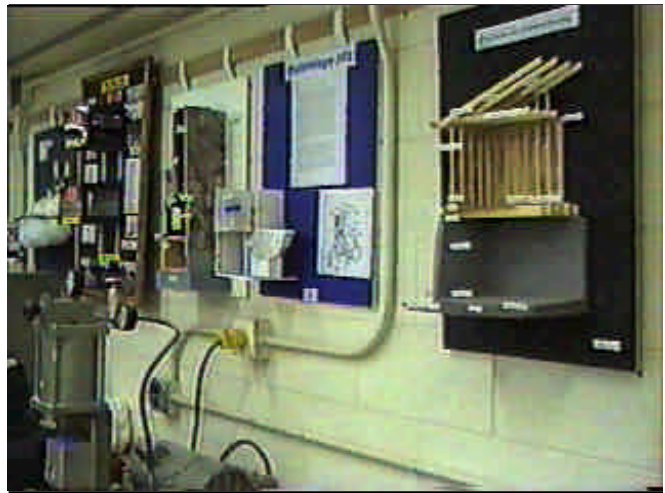
Scene # 4 Duration: 7 Seconds Video: Moving camera; shows all cross section projects. Audio: Narration and Music