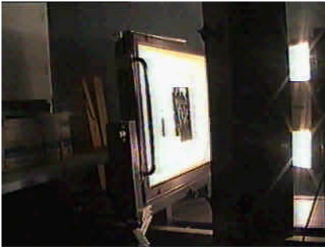
Scene # 9 Duration: 13 Seconds Video: Pan of process camera.