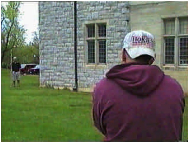
Scene # 5 Duration: 8 Seconds Video: Video of surveying. Camera pans into transit level. Audio: Narration and Music