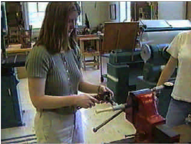
Scene # 3 Duration: 6 Seconds Video: Video of the plumbing exercise. Audio: Narration and Music