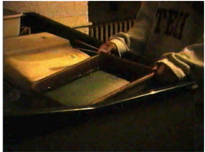
Scene # 10 Duration: 5 Seconds Video: Video of darkroom process.