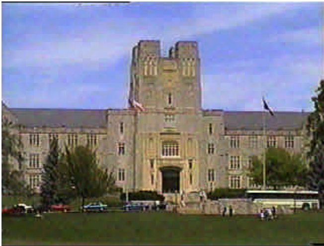
Scene # 1 Duration: 6 Seconds Video: Burruss with beginning title "Technology education at Virginia Audio: Tech" Narration and Music begin