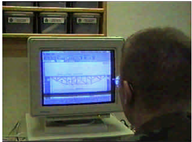
Scene # 8 Duration: 6 Seconds Video: Zoom into bridge builder program. Audio: Narration and Music