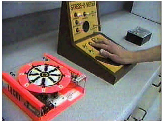
Scene # 6 Duration: 10 Seconds Video: Moving camera. Video of electronic enrichment projects. Audio: Narration and Music