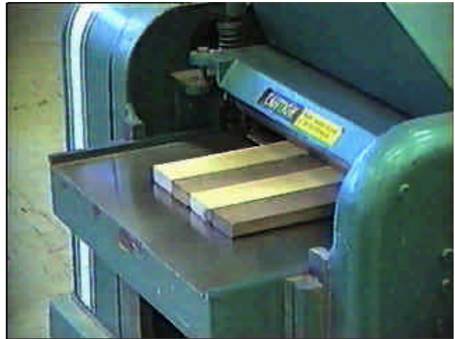
Scene # 2 Duration: 8 Seconds Video: Construction - planar being used. Audio: Narration and Music