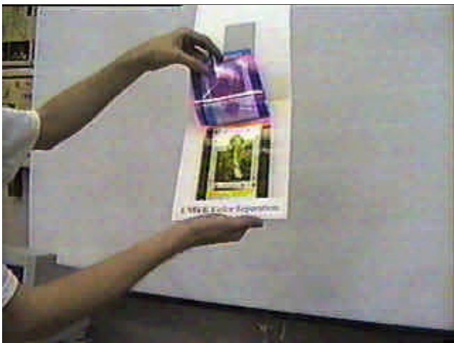
Scene # 11 Duration: 6 Seconds Video: Video of color separations.